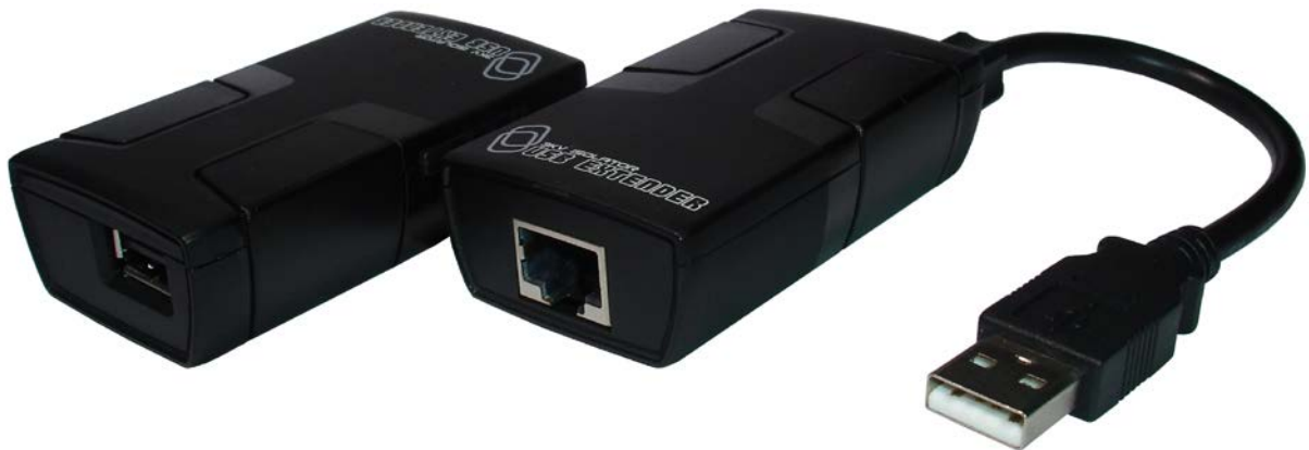
USB Isolator Extender